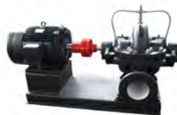
NDS Horizontal axial split casing double suction pumps